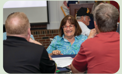
U.S. Rep. Annie Kuster joins a breakout session at the veteran summit.