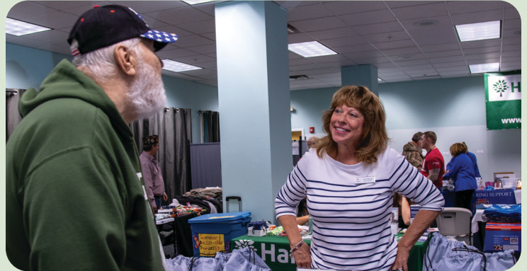
Dozens of service providers will gather at the Double Tree Expo in Manchester on September 8 to help veterans in need.

The resource expo connects local veterans experiencing or at-risk of homelessness to necessary care and supports. Resources on-hand include employment services, medical, dental, social, and legal services, a hair dresser providing haircuts, and more.