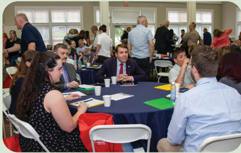
U.S. Rep. Chris Pappas engages with veteran summit participants.