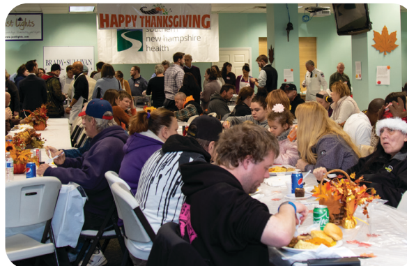
More than 300 community members look forward to the annual Thanksgiving dinner.

Harbor Care will host its annual Thanksgiving Community Dinner and Celebration the Tuesday before Thanksgiving. The event will bring together more than 300 vulnerable community members in fellowship to enjoy a delicious meal.